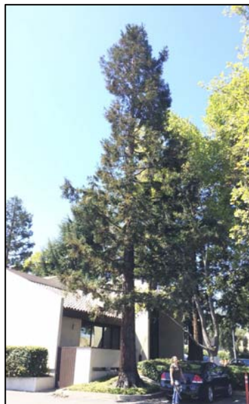
Photo 3 (left): Tulip poplars #65 and 66, growing on a landscape mound along Bandlely Dr., were in fair condition.