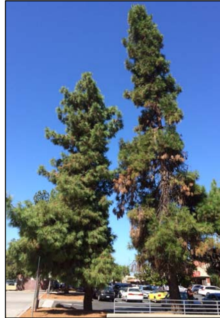
Photo 2: Canary Island pine #16 (l) was in good condition. Tree #17 (r) was in fair condition with good structure and thin lower crown.

Two tulip poplars (#65 and 66), located on the west perimeter, were in fair condition and were mature, with 25-inch diameter trunks (Photo 4). Trees had fair structure, with codominant and multiple stems, and slightly thin crowns. Tree leaves and surrounding pavement were sticky with honeydew – an indication of either scale or aphid infestation.