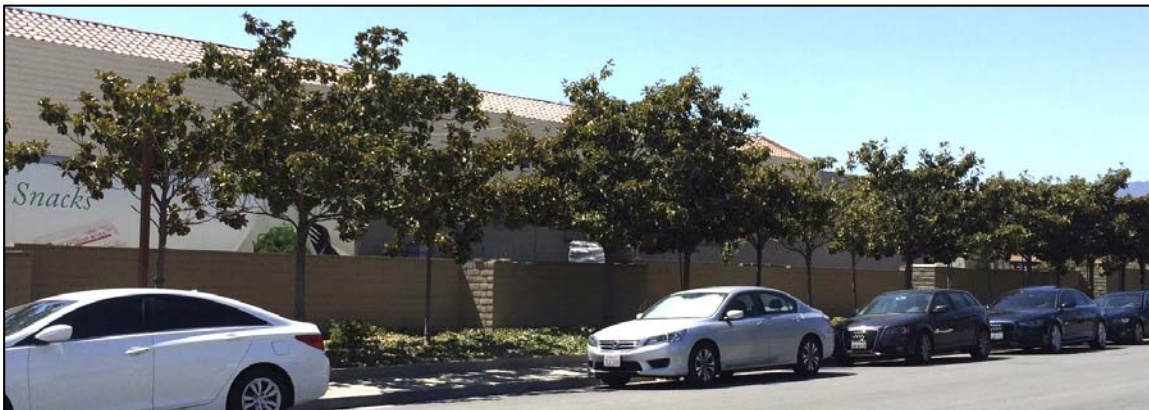
Photo 1: A row of southern magnolias (#80-95, r-l) along Alves Dr. were in fair and poor condition with small crowns and dieback.

The most common species present was southern magnolia, with 59 trees (59% of the population). Trees were growing in small parking lot planters and in a row along Alves Drive (Photo 1). Overall, trees were in fair (42 trees) and poor (17 trees) condition. Southern magnolias were characterized as being stunted in growth – none of the trees was larger than 12 inches in diameter – and many had thin crowns and twig dieback, conditions that were likely caused by