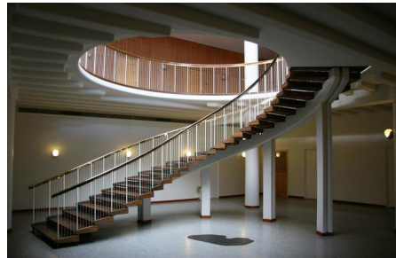
Aarhus Townhall, Denmark