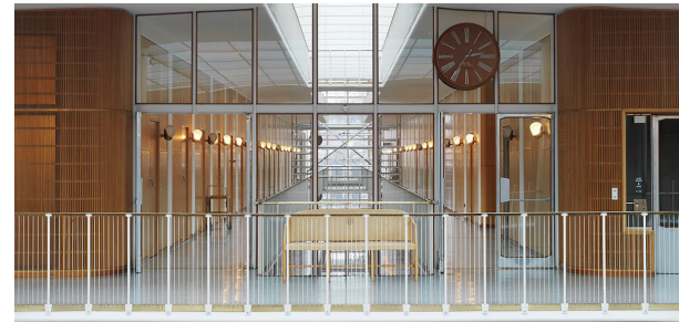
Aarhus Townhall, Denmark