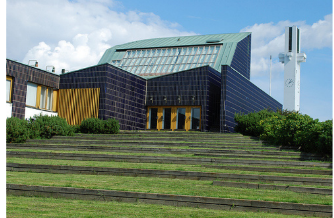
Seinajoki Townhall, Finland