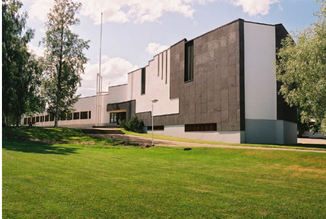
Alajarvi Townhall, Finland