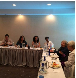
May Mixer at the Cupertino Hotel

Office of Economic Development | City of Cupertino | 408.777.7607 | econdev@cupertino.org | www. In Business Cupertino.com