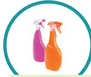
Household Cleaners & Garden Chemicals