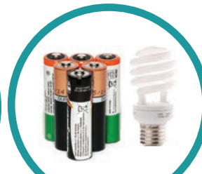
Fluorescent tubes, CFLs, and batteries

For more information visit www.cupertino.org/environmentalday or call Recology at (408) 725-4020