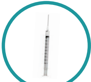
Sharps & Needles