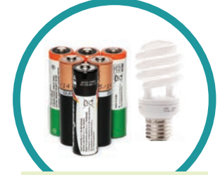
Fluorescent tubes, CFLs, and batteries