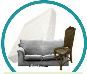
Worn & Damaged Furniture

Visit www.recology.com/cupertino for full list of accepted items.