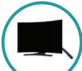
Computer Monitors & TVs