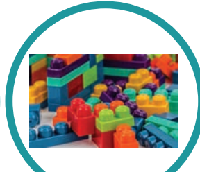
Plastic toys and play structures