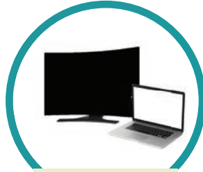
Computers & Electronics