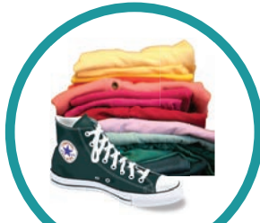
Clothing & Shoes