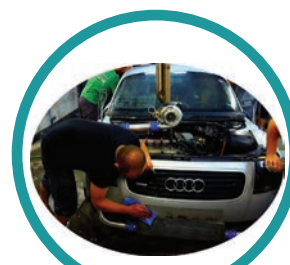
Auto Products (gasoline, oil, etc)