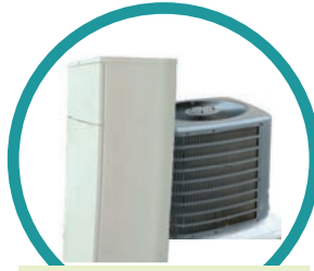
Refrigerators, Air Conditioners, & Other Appliances