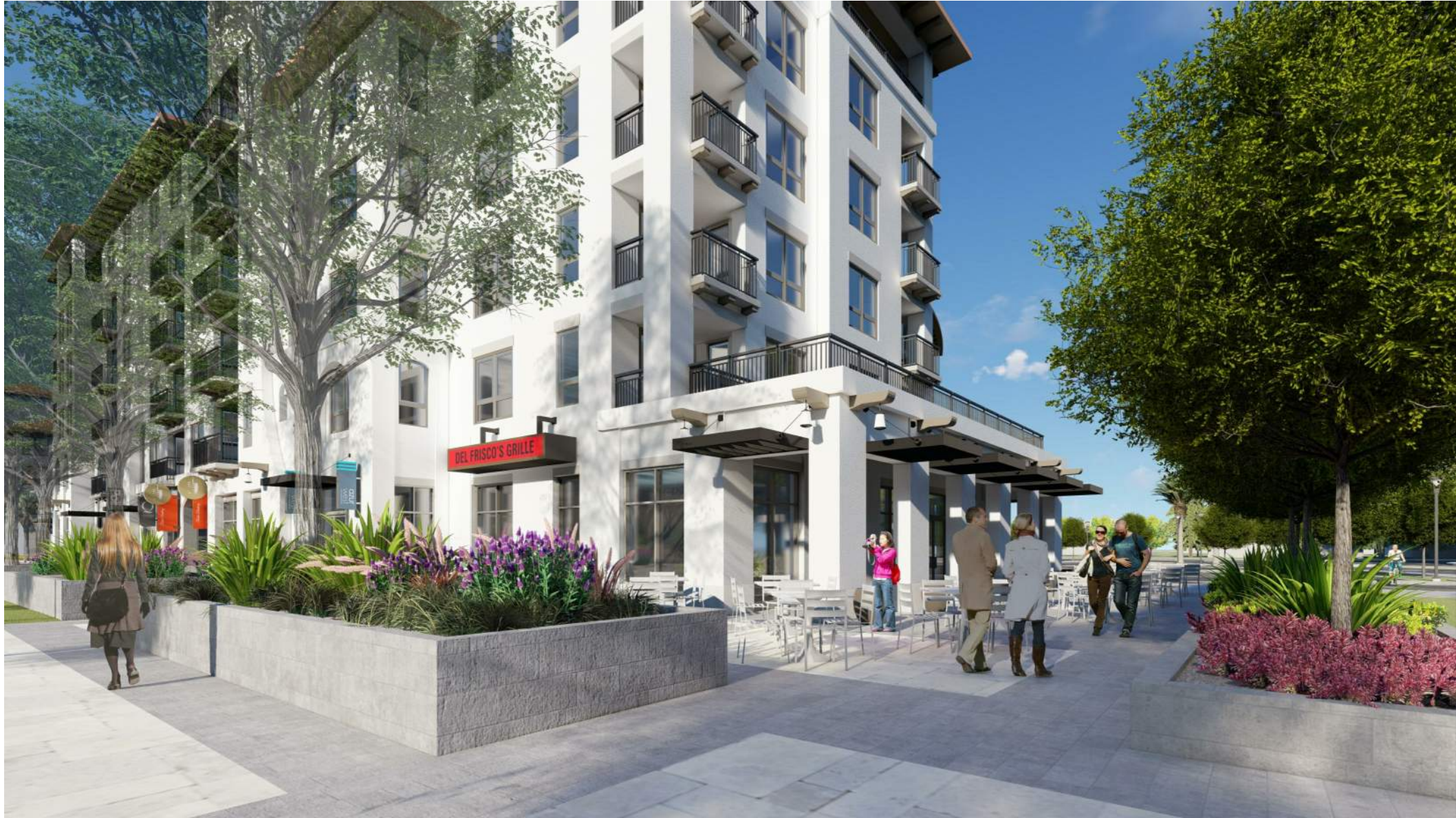
3/A211 - VIEW OF BUILDING 1 AT CORNER OF STEVENS CREEK BOULEVARD AND MARY AVENUE