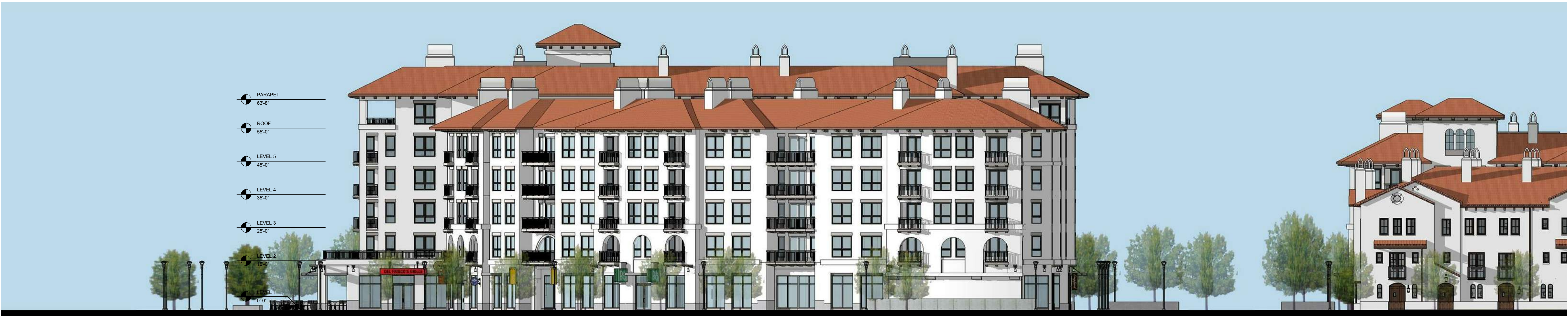
1 BUILDING 1 - MARY AVE ELEVATION - NORTH A214 1/16" = 1'-0"