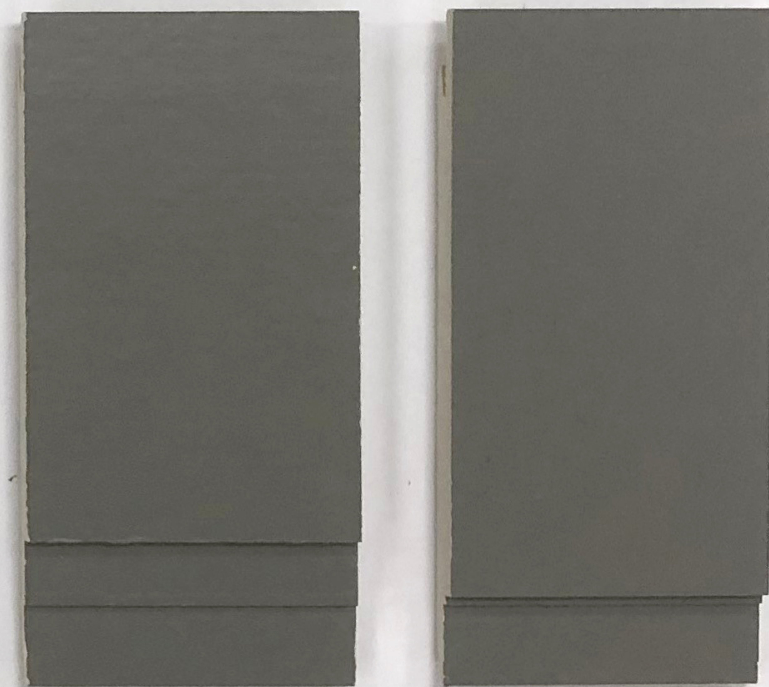
HARDIE BOARD SIDING