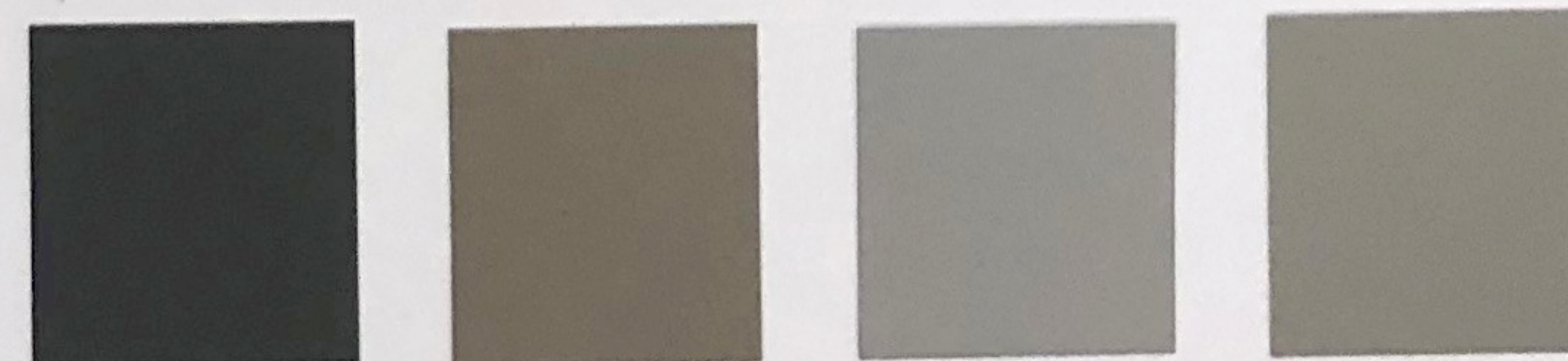
ALUMINUM PANEL COLORS