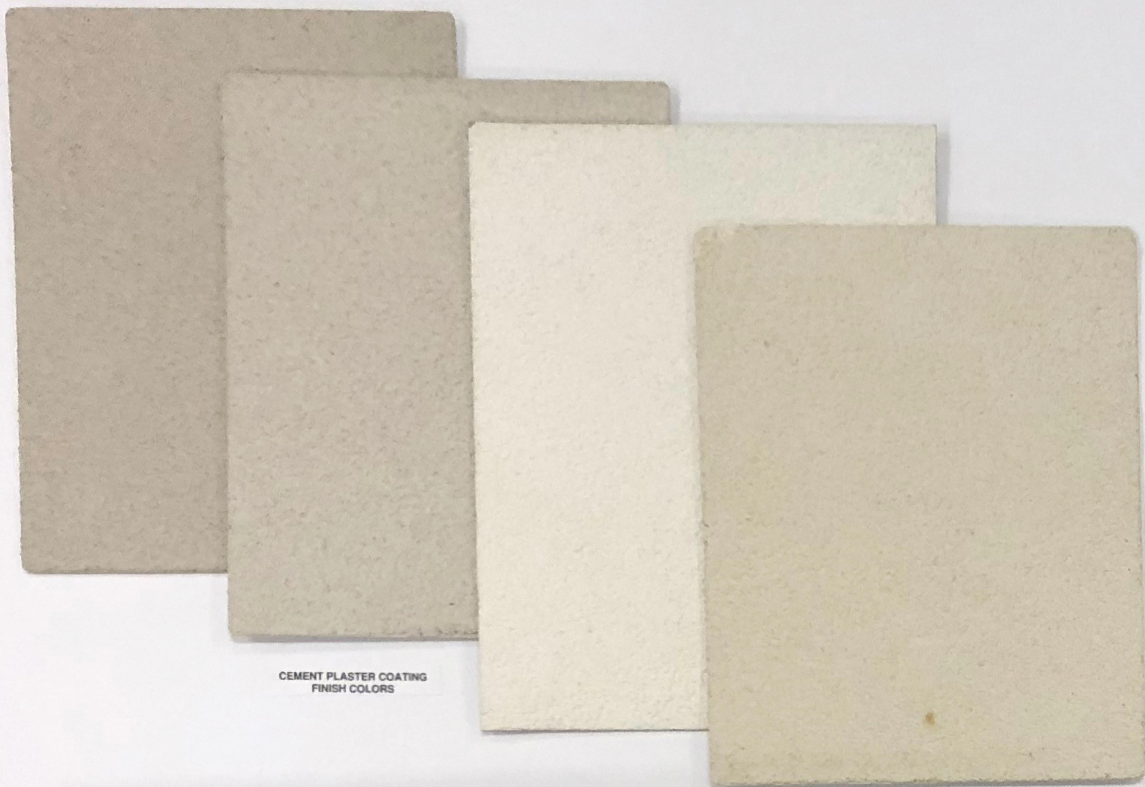
CEMENT PLASTER COATING FINISH COLORS