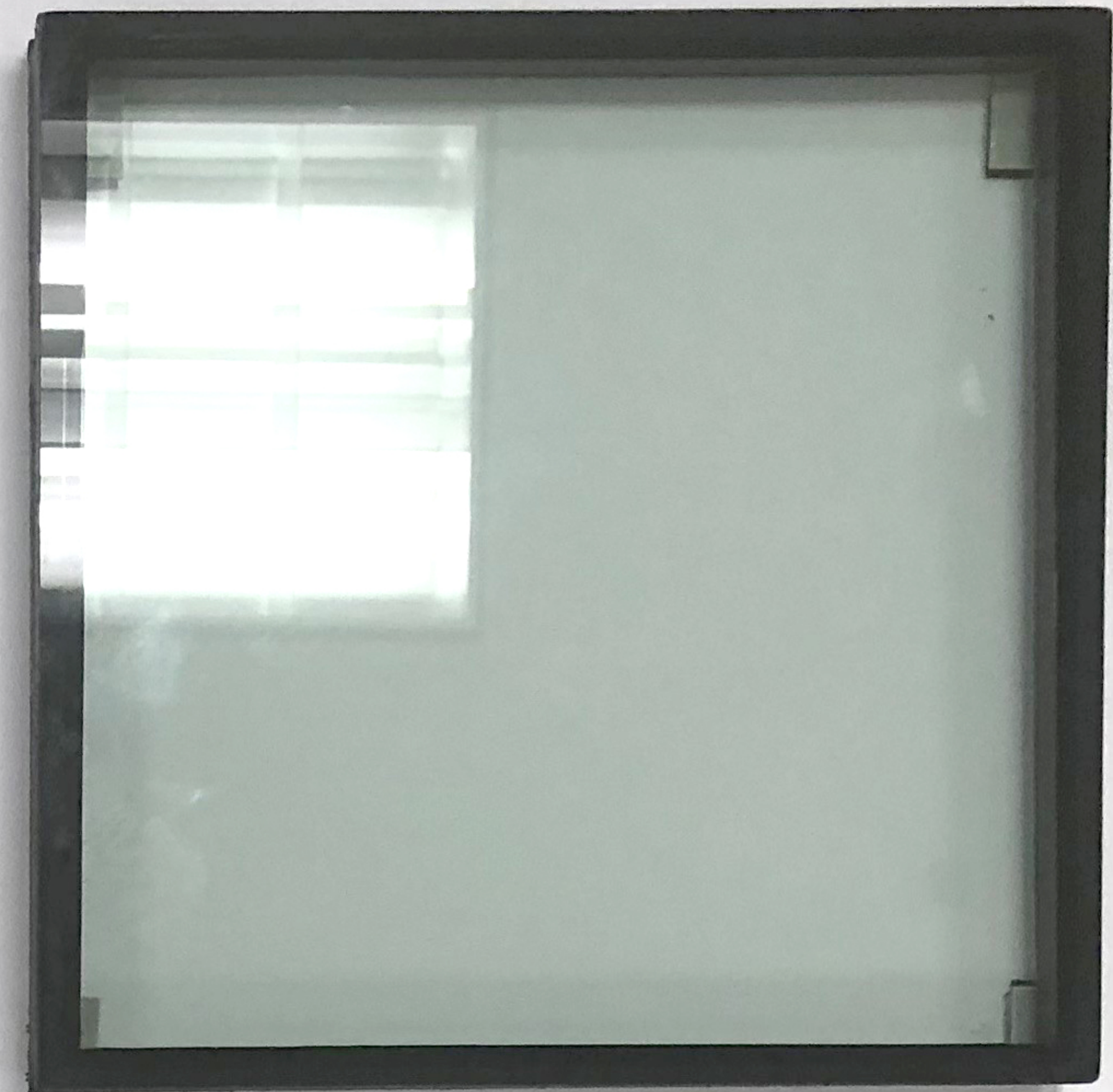
INSULATED GLASS WITH LOW E COATING