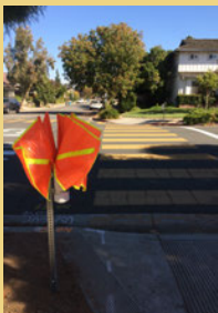
New Crossing Flags @ Lawson