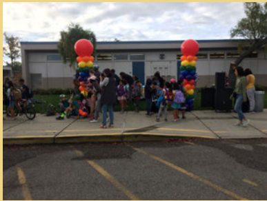
Eaton Walk & Roll