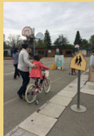
Garden Gate Bike Rodeo