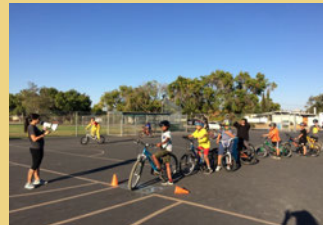
Hyde Bike Rodeo