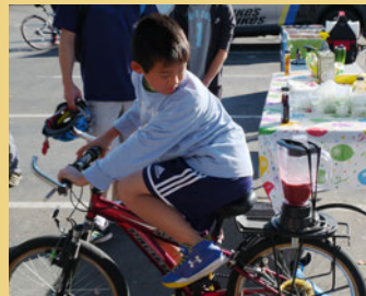
Bike Blender @ Fall Bike Fest