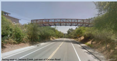
Facing west on Stevens Creek, just east of Carmen Road

We are currently gathering input on how our Working Group meetings will work best for people next year. Please indicate when you are available to meet and what you would like to discuss by taking our survey here: www.cupertino.org/saferoutes