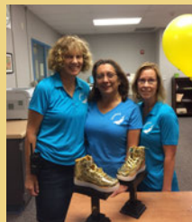
Golden Sneaker Award @ Sedgwick