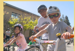
Pedal for the Planet Bike Ride @ Earth Day Festival