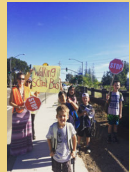
Walking School Bus @ Lincoln