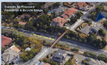
Carmen Rd Proposed Pedestrian & Bicycle Bridge