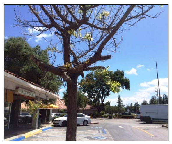
Photo 1 : Looking east at Chinese pistache #76. The tree was young, at 5" in diameter and in poor condition. It had been topped and the branches reduced to stubs. This was the typical treatment of all Chinese pistache at the site.

Evergreen ash were located along the Mary Ave. frontage (#25, 26, 31, 32, and 58-64), the west side of the building (#33-40) and the Stevens Creek Blvd. frontage (#78-85). Diameters ranged from 12" to 34" with 6 young trees (12-18" in diameter), 9 semi-mature (19-24") and 9 mature trees (25-34"). Some of the evergreen ash had ben topped, others had been root pruned to repair adjacent infrastructure. Twelve