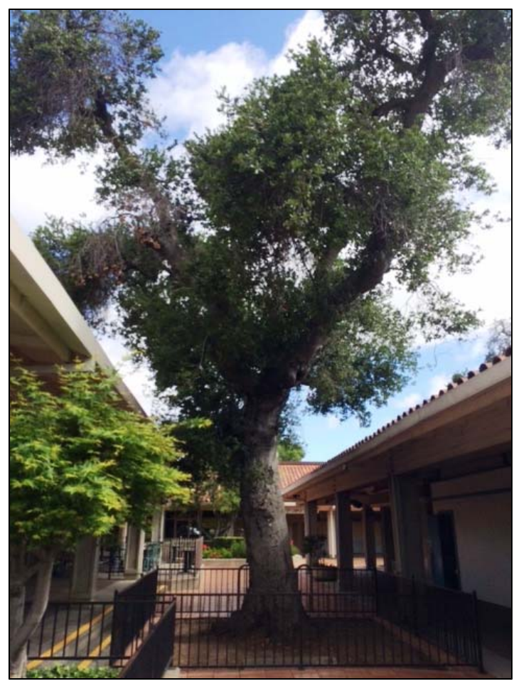
Photo 2: Looking east at coast live oak #19. The tree was mature, at 29" in diameter. It was in poor condition, with extensive dieback in the crown. Non-industry standard cables had been installed.

The remaining 10 species were represented by 3 or fewer individuals and included: