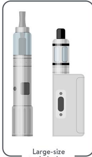
Large-size tank devices