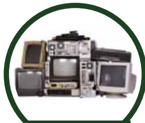
Computers & Electronics