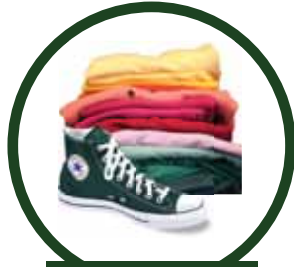
Clothing & Shoes