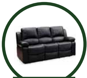
Furniture (good condition)

For Donation: Reusable items. No dirty, broken, stained, or torn items. No mattresses.