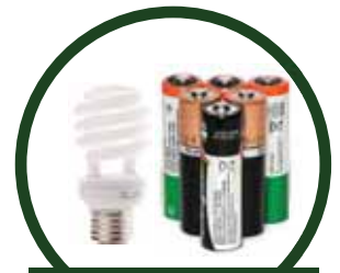
Fluorescent tubes, CFLs, and batteries

One trip per household if a line has formed. Residents responsible for unloading materials. Residents must provide a current Recology collection bill and personal identification to verify Cupertino residency.