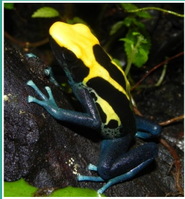
Yellow Poison Dart frog

There are over 600 mammals species, over 1,500 fish species and over 100,000 different types of insects in Brazil!