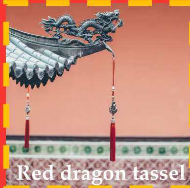
Red dragon tassel

China is one of the world's oldest civilizations