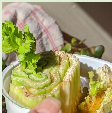
Learn how to regrow veggie scraps