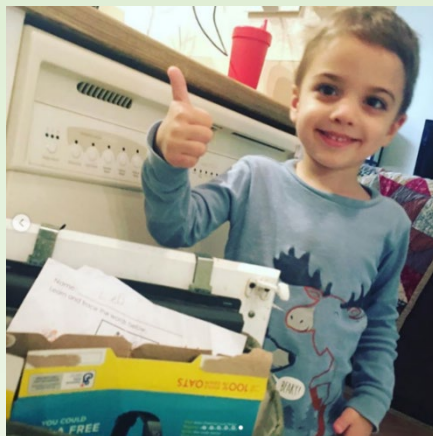
Test your knowledge with the waste sorting challenge