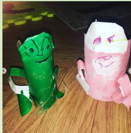
Create art with recyclable materials in your home