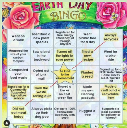
Play Earth Day Bingo with your family and friends