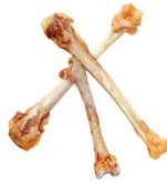
Meat + bones