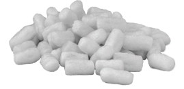
Packing foam + foam containers