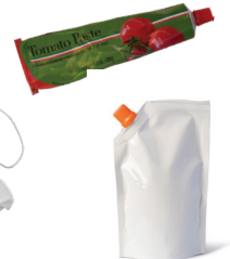
Tubes + pouches