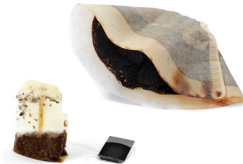
Coffee filters + paper tea bags