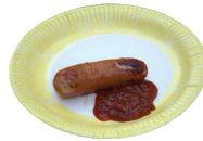
Greasy or food-soiled paper + tissues