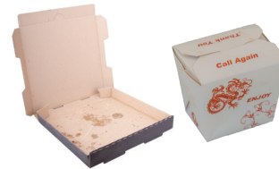
Paper take out containers