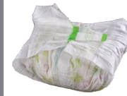
Diapers + pet waste