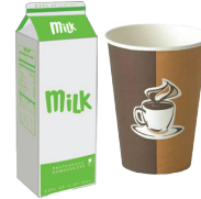
Cartons + paper cups