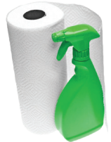
Chemical paper towels