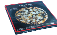
Frozen food boxes