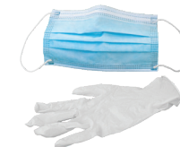
Masks + gloves