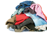
Clothes + fabric