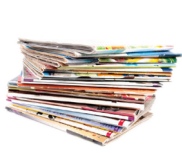
Newspaper + magazines

Place these items in your recycling cart