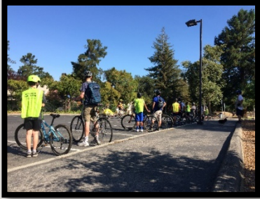
Socially Distant Middle School Bike Skills Workshop