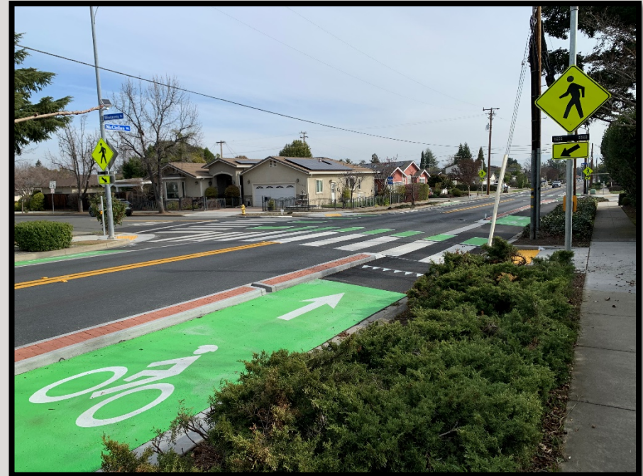
McClellan Road Class IV Bike Lanes