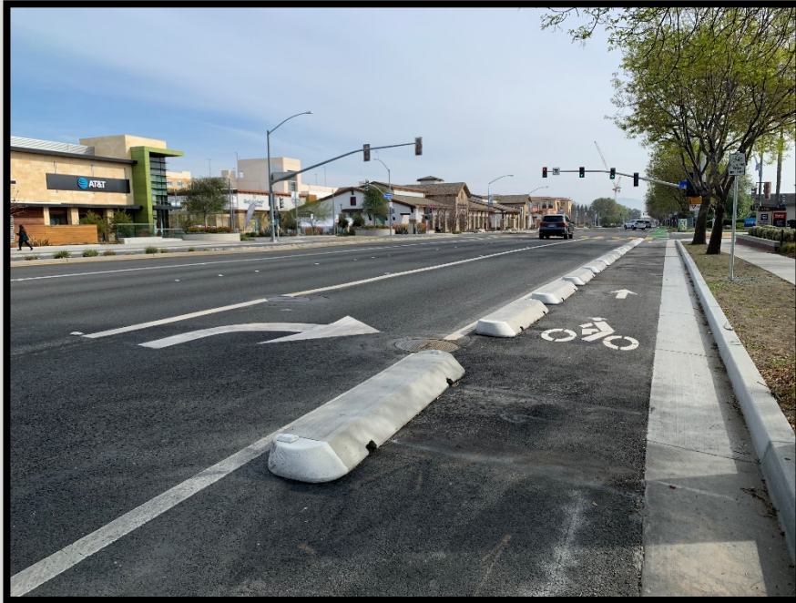
Stevens Creek Boulevard Class IV Bike Lanes