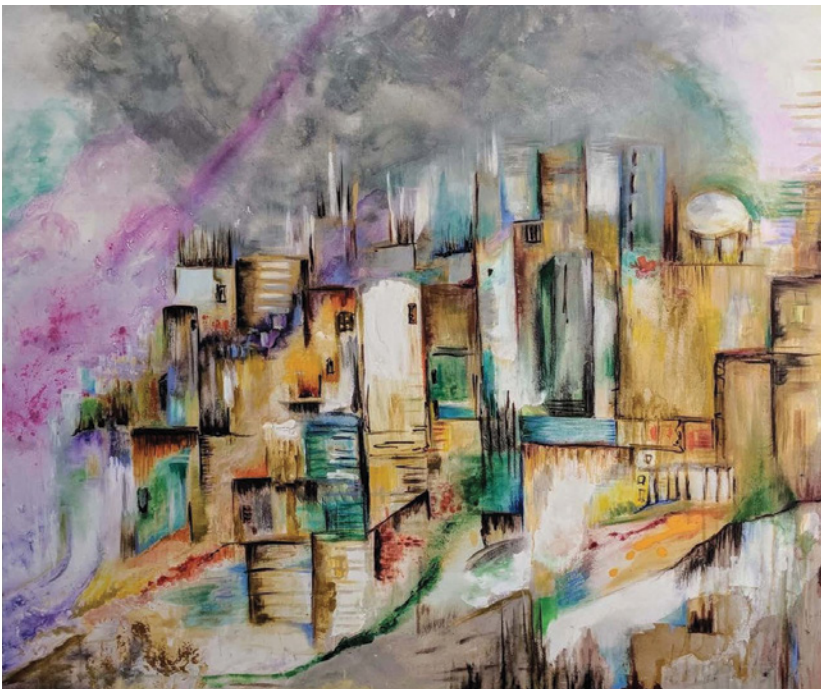
Art by Geeta Taneja