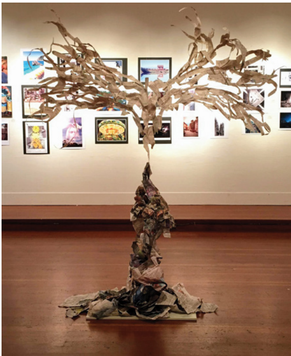
Art by Rachael Ding

The Emerging Artist Award was established to encourage and recognize demonstrations of artistic promise. This award recognizes younger artists, as well as those rediscovering their love of artistic expression later in life. Judging criteria includes evidence of imagination and individuality, as well as effective use of media and tools to create a work of personal expression.