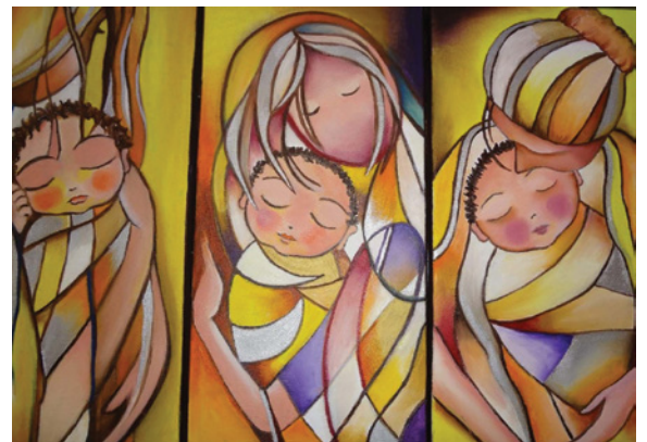
Art by Geeta Taneja