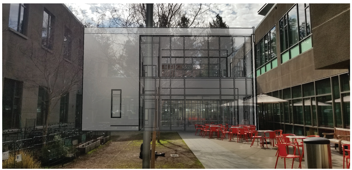
View of the courtyard facade (ehdd)

Please visit the sccld.org website for more history, photos, and information about the Cupertino Library.