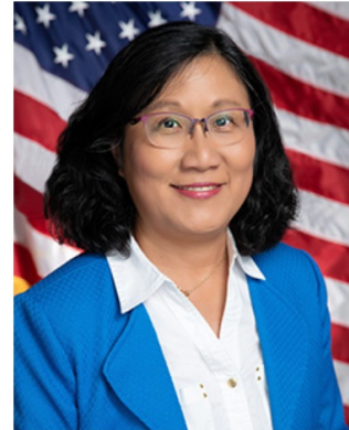
Liang Chao Vice Mayor