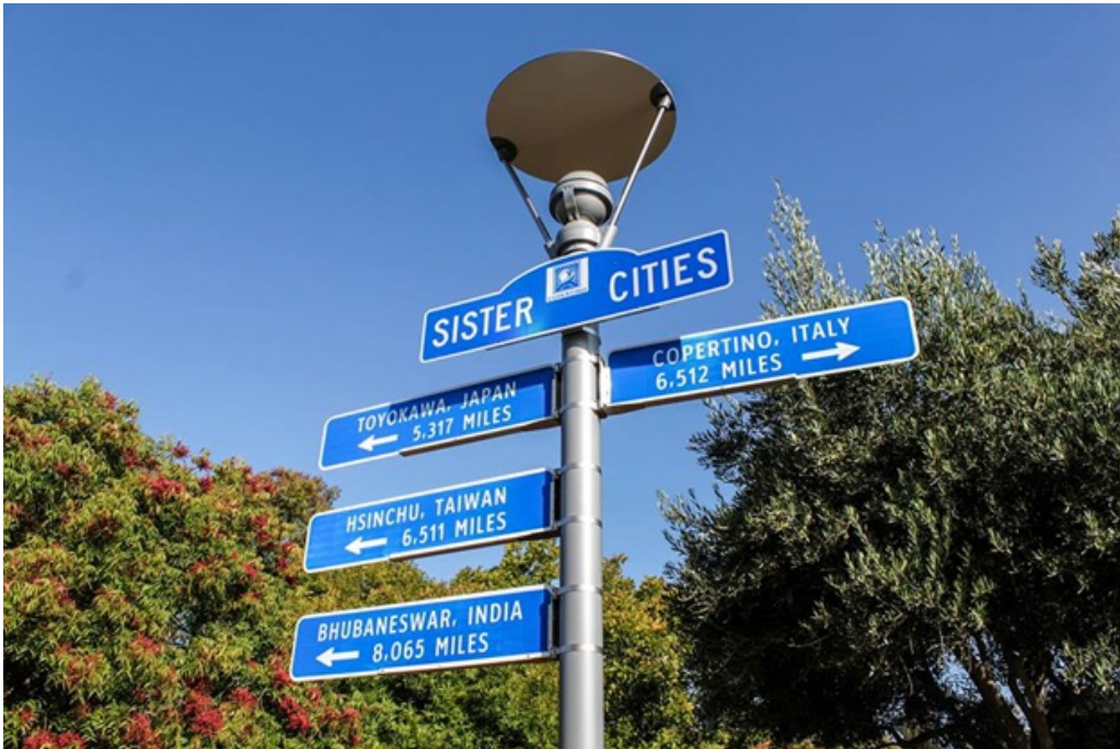
Cupertino Sister Cities Sign