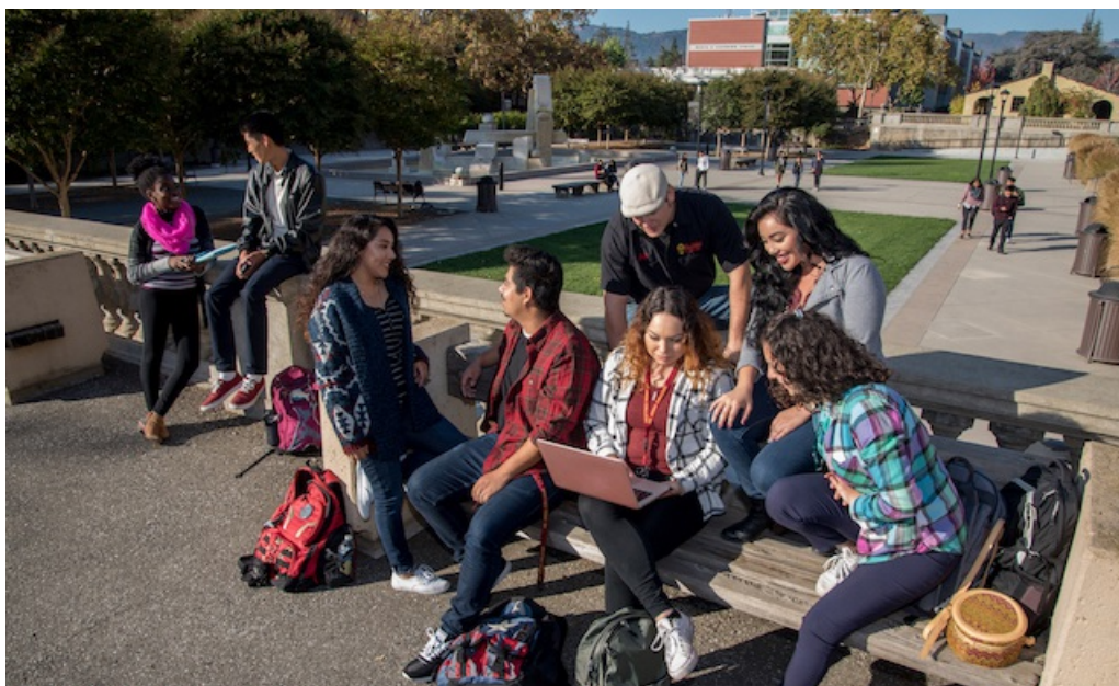
De Anza College Campus

Building on its tradition of excellence and innovation, De Anza College challenges students of every background to develop their intellect, character, and abilities; to achieve their educational goals; and to serve their community in a diverse and changing world.