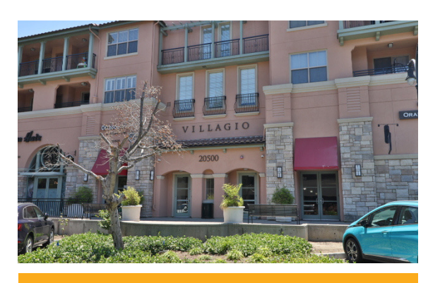
1- 4 BEDROOM UNITS