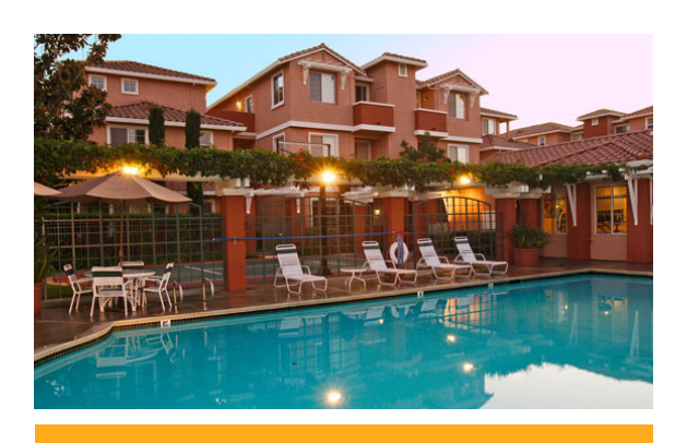
1, 2 AND 3 BEDROOMS