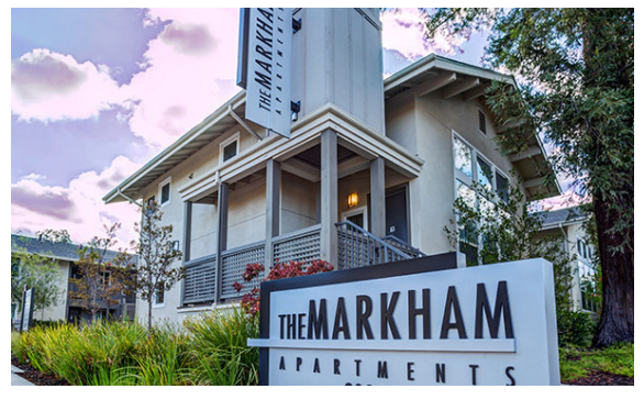
9 DIFFERENT BUILDINGS