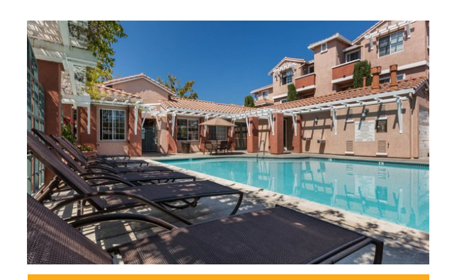
142 RENTAL UNITS