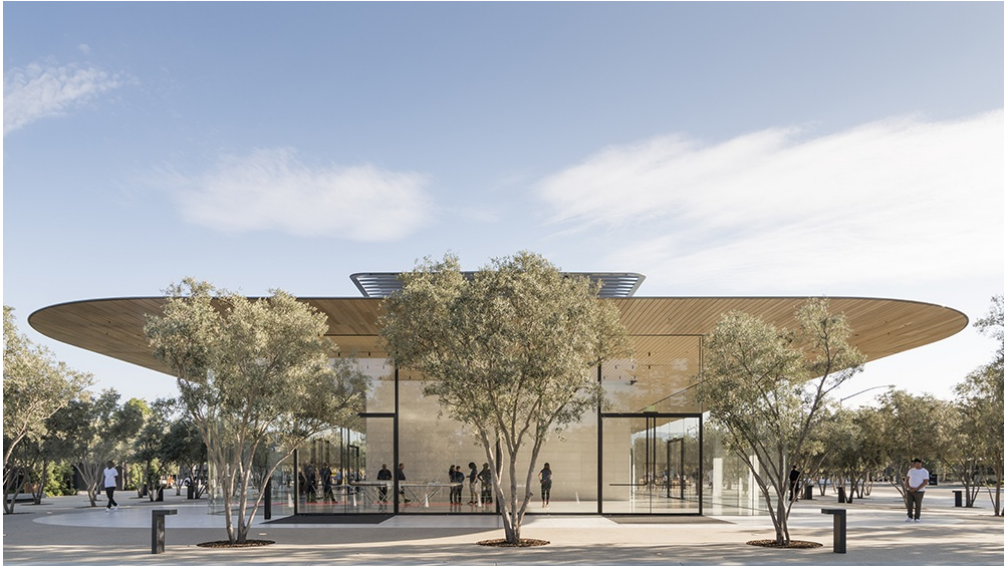
Apple Park Visitor Center

In the late 20th century, Cupertino and the surrounding areas experienced another surge in population growth, this time due to the immigration of people from Asian countries. Immigration laws at the time were in the favor of families looking to move to Silicon Valley. People immigrated here for a variety of reasons—whether they were aspiring for career prospects with major tech companies, or striving for quality education for their children, everyone who immigrated here had a common goal: to find opportunities to work hard for a better life for themselves and their families.