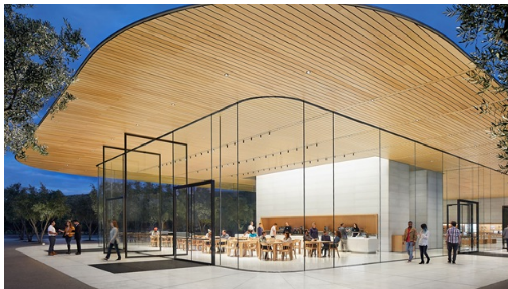
Apple Park Retail Store

Recently approved is the redevelopment of The Oaks Shopping Center site, located off of State Route 85 freeway and across from De Anza College. The Westport Cupertino project will be a mixed-used development consisting of 259 housing units (Rowhouse/Townhomes, senior apartments) 35 memory care rooms, and 20,000 square feet of commercial space.