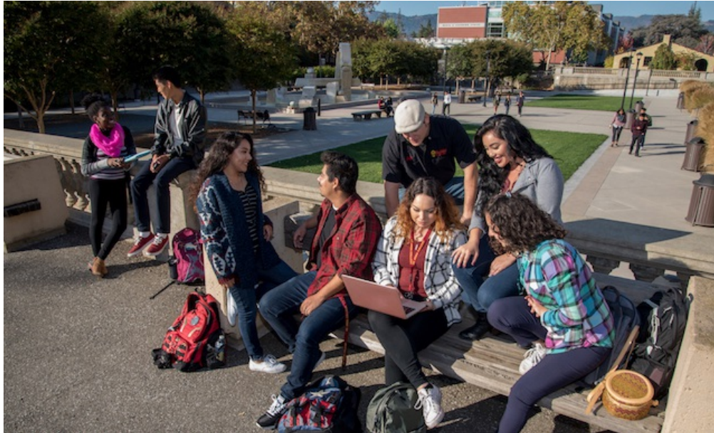
De Anza College Campus

Building on its tradition of excellence and innovation, De Anza College challenges students of every background to develop their intellect, character, and abilities; to achieve their educational goals; and to serve their community in a diverse and changing world.