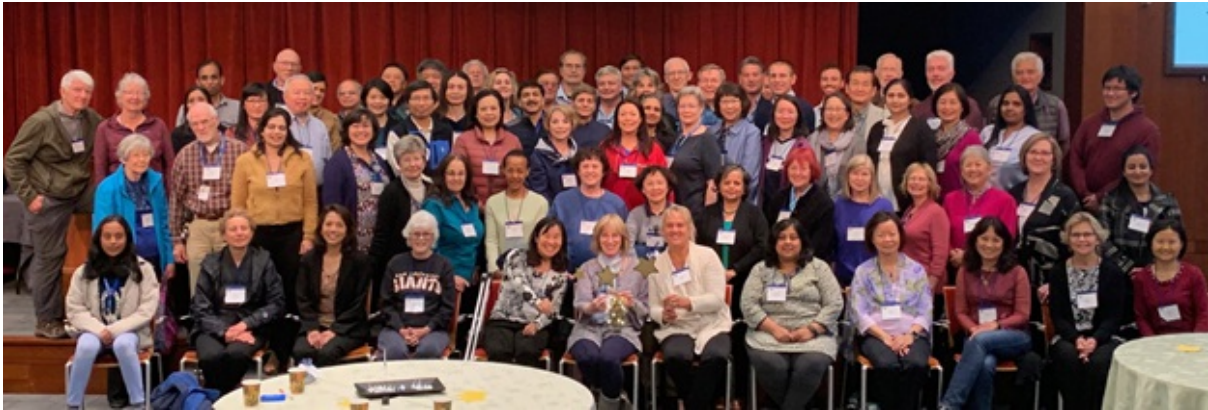
Neighborhood Block Leader Program

A connected community is a safer and more resilient community. Block Leaders are engaged Cupertino residents who go the extra mile to build a sense of trust and community in their neighborhoods. The program shares City news, hazards, and events with Block Leaders, provides support for community building, and organizes quarterly meetings. Meeting topics include crime prevention, emergency preparedness, and presentations from City Divisions to help residents learn more about their City. Leaders facilitate information sharing between the City and residents, host community gatherings, and build a sense of trust and safety in their neighborhoods. To become a Cupertino Block Leader, please contact the Block Leader Coordinator at martad@cupertino.org .