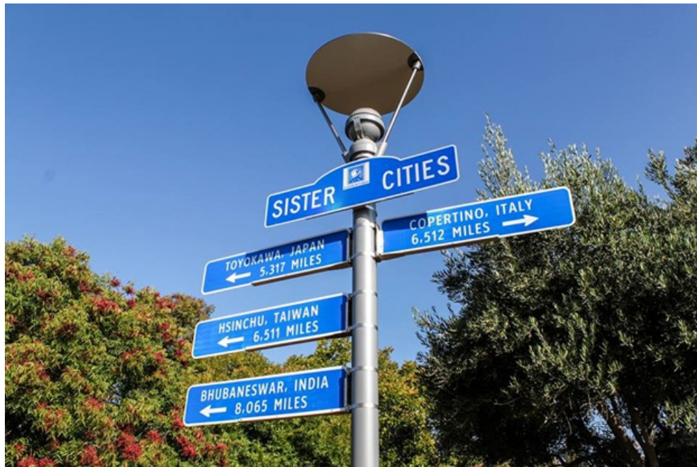
Cupertino Sister Cities Sign

The City of Cupertino recognizes the value of developing people-to-people contacts by strengthening the partnerships between the city and its four sister cities of Copertino, Italy; Hsinchu, Taiwan; Toyokawa, Japan, and Bhubaneswar, India. Cupertino’s Sister City partnerships have proven successful in fostering educational, technical, economic, and cultural exchanges. Over the years, there have been many delegations visiting both the cities as well as many local students participating in annual student exchange programs.