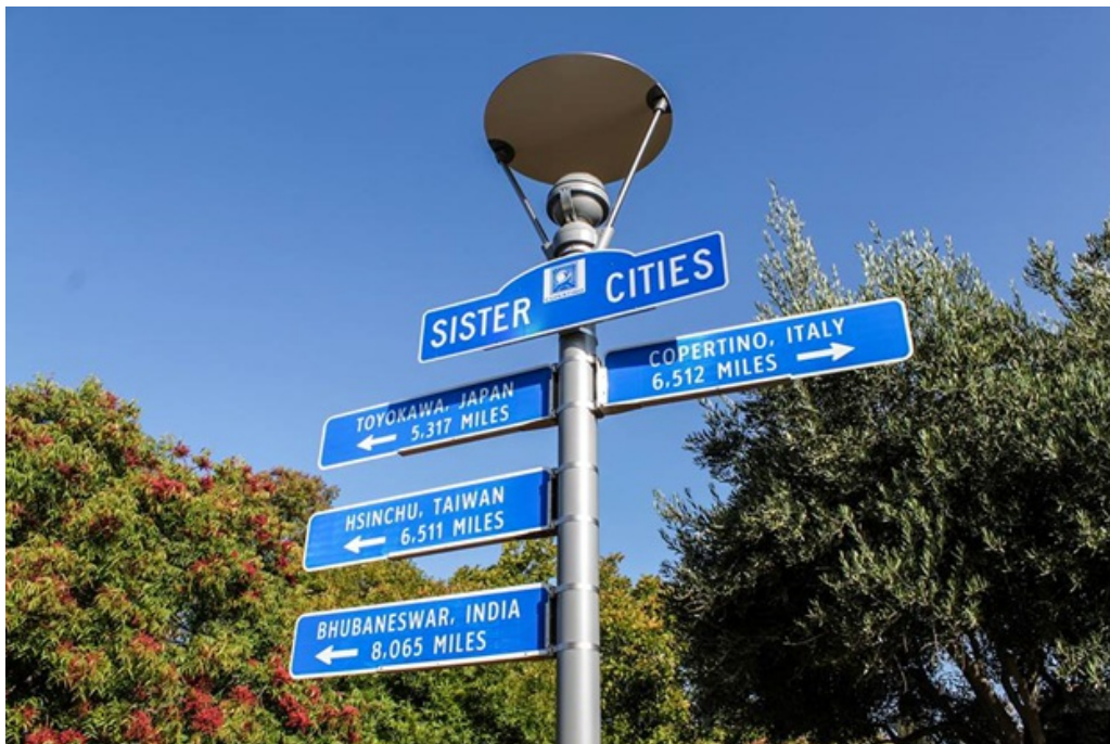
Cupertino Sister Cities Sign

The City of Cupertino recognizes the value of developing people-to-people contacts by strengthening the partnerships between the city and its four sister cities of Copertino, Italy; Hsinchu, Taiwan; Toyokawa, Japan, and Bhubaneswar, India. Cupertino’s Sister City partnerships have proven successful in fostering educational, technical, economic, and cultural exchanges. Over the years, there have been many delegations visiting both the cities as well as many local students participating in annual student exchange programs.