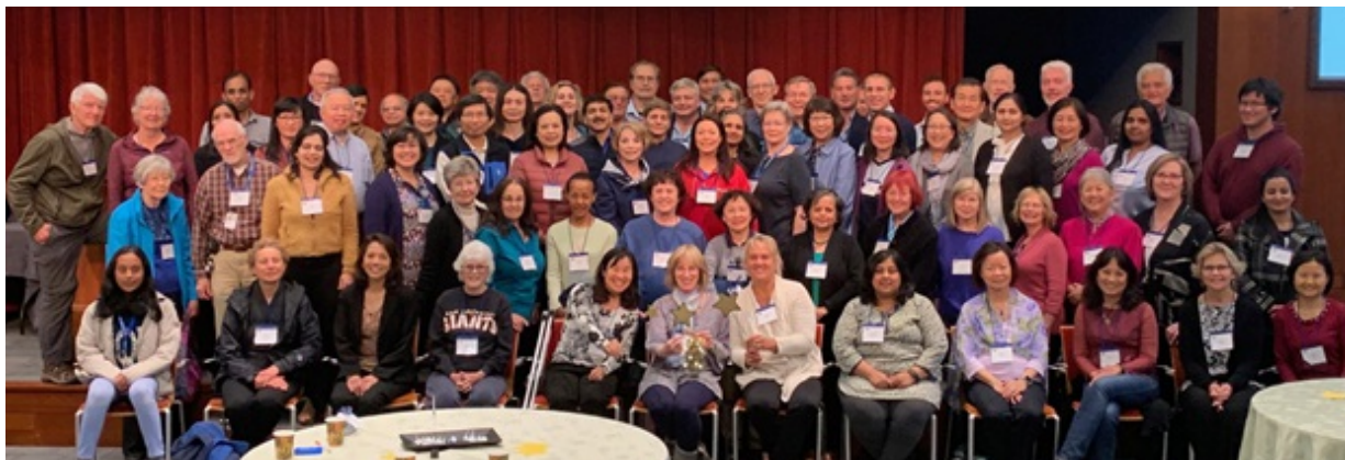
Neighborhood Block Leader Program

Block Leaders are engaged Cupertino residents who go the extra mile to build a more connected and resilient community. The program shares City news, hazards, and events with Block Leaders, provides support for community building, and organizes quarterly meetings. Quarterly meetings invite City staff from across departments so that volunteers and residents are kept up to date on new policies, programs, and projects. Volunteers facilitate information sharing between the City and residents, host community gatherings such as emergency kit building workshops, and build a sense of trust and safety in their neighborhoods. To become a Cupertino Block Leader, please contact the Block Leader Coordinator at martad@cupertino.org .