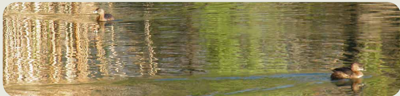
Alamitos Recharge Pond

Keeping debris out of creeks helps water flow. Creeks are a valuable natural resource that support sensitive wildlife and ecosystems and also serve as natural drainage systems that carry storm water away from homes, roads and businesses safely to the bay. For our waterways to carry runoff during heavy rainfall, it is important to keep creeks free of trash and debris, which can impede the flow of water and cause flooding. While most people realize trash and chemicals should not go into a creek, many don't know that yard waste, leaves and soil also pollute a creek and can obstruct water flow, resulting in flooding and erosion.