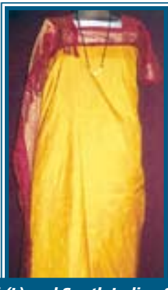
North Indian Sari (L) and South Indian Sari (R)

There are also wedding photos of some of Cupertino's old families: the Mariani, Picchetti, Gagliasso and Svilich families. There are some old photos where the participants were not known - maybe when you come in to look at the exhibit, you might be able to help identify some of the people in the exhibit pictures and fill in some local history. These photos in "Roots" don't do justice to these beautiful gowns to show the incredible and delicate details. And remember, almost everything on these gowns was done by hand.