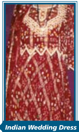
Indian Wedding Dress