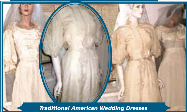
Traditional American Wedding Dresses