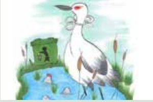
Apanuba, Monta Vista High School

The City was very impressed with the creativity and thoughtfulness of more than one hundred students that offered their time and talents to produce incredible environmental art for our contest. Cupertino students were invited to create artwork addressing the fate of the waste we produce, changes we can make to reduce it, and connecting waste to issues like water quality. Winning pieces will be used to create reusable shopping bags to encourage our community to reduce waste and reach for their reusable bags when shopping at our local stores.