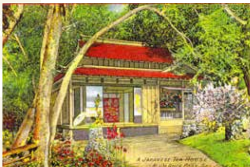
The Japanese Tea House stood at the entrance to the picnic area. There were stories about of the swarms of yellow jackets that habitually preyed on the visitor's picnic delicacies. Apparently the proprietors of the tea house would burn piles of newspapers to keep them away. Undated postcard.

At the very end of this charming book, Cupertino's own little known "spring" rates 2 1/2 lines and is mis-located as being in San Jose, which it is not. Our spring is the "dripping rock" of this article's title. Soda Rock is located on Stevens Canyon Road, past the dam and up into the foothills. It was a favorite spot for picnics in the old days. For as long as anyone can remember, Soda