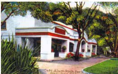
The later stucco-exterior café was larger and more luxurious than the earlier wooden structure. Undated postcard.

Alkaline waters were helpful in the reduction of discomfort due to excess stomach acidity; waters with measurable salt content would no doubt stimulate the appetite. Waters high in sulphur may well have had a real effect in the treatment of certain skin diseases. And hot springs baths could be most effective in soothing sore, overworked muscles.